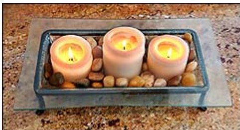
A Feng Shui display of fire, water and earth sits atop the kitchen island in the home of Lani Wharton.

Brandmaier also helped the couple place their bed and bedroom in the best spot. And Wharton added a turn at the end of a hallway because straight lines are not good Feng Shui. The interior of the home is dominated by wood, stone and natural fibers. The floors are all wood, and televisions are hidden behind wooden doors.